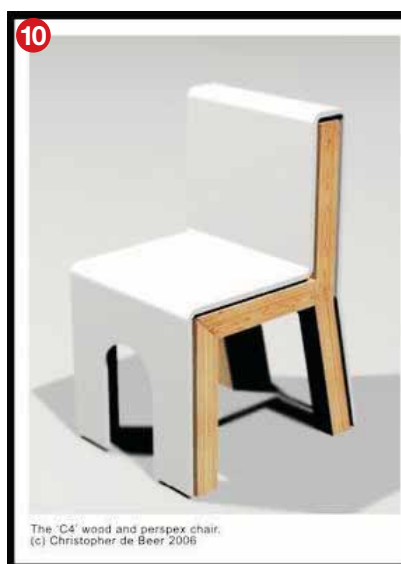
The 'C4' wood and perspex chair.