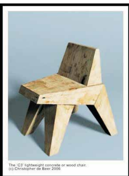
The 'C3' lightweight concrete or wood chair. (c) Christopher de Beer 2006